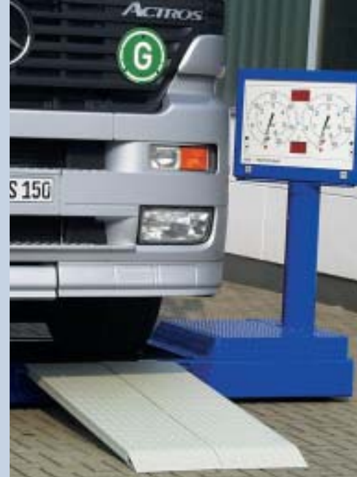
You stay flexible: The VARIOFLEX 306 On-floor + MOBILE can immediately be used – everywhere.